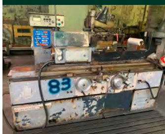
External grinder TACHELLA 1015 UA

Max grinding length mm 750 Max Diameter mm 305 Wheel size mm 450x127