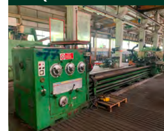
LATHE PASQUINO MOD. NDS 450

Centre height on the bed mm 450 Turning diameter 920 mm Distance Between centre mm 8000