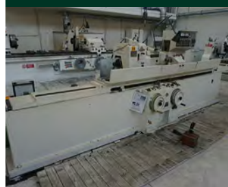
External grinder ZOCCA 2000/3

Max grinding length mm 1600 Max Diameter mm 300