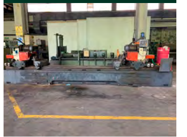
CENTRING MACHINE TOVAGLIERI-HYDROCENTR X2

WITH 2 HEAD -Max/min workpiece length allowed for two simultaneous facing and centerings and with workpiece clamped with two vices mm 5000-170 mm