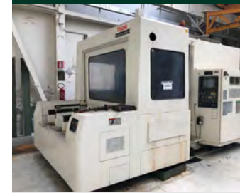
MACHINE CENTRE MAZAK H630

CNC MAZATROL M-32 Dimension mm 630x630 Axis X stroke mm 1000 Axis Y stroke mm 800 Axis Z stroke mm 750 ISO 50 ATC 120 positions