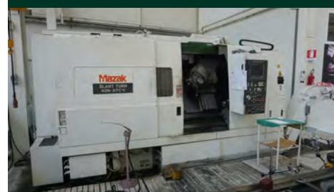
TURNING MAZAK 40N ATC

EQUIPPED WITH HEAD, CONTINUOUS AXIS C CNC MAZATROL T.3 Turning diameter mm 540 Turning length mm 1510 Turret 60 tools ISO 50