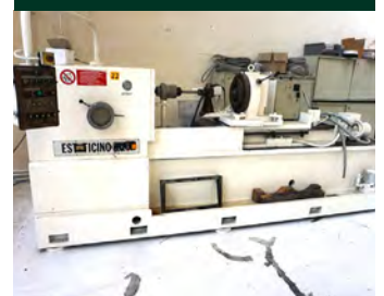
DEEP HOLE DRILLING

Height of centre mm 220 Deep mm 700 Positioning mm 800 RPM 8-600