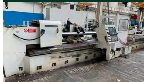
LATHE SAFOP LEONARD 550NC 8500

AXIS C CNC ECS 2400 N.2 controlled carriages with automatic 4 way toolpost Automatic milling head ISO 50