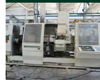
LATHE UTITA T450x4000

CNC ECS 2302 Max turning diameter on the carriage mm 450. Max turning length mm 4000 Max installed power kW 50 -N. 3 hydraulic rests Morari mm 17-125