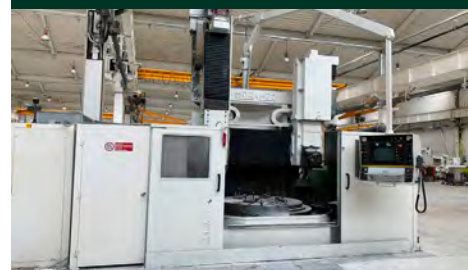
CNC VERTICAL LATHE MORANDO KL 14

Spindle diameter mm 1450 Turning diameter mm 1680 Max turning height mm 1100 Taper ISO 50 Double RAM