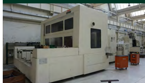
MACHINE CENTRE MAZAK H1250

Pallet dimensions mm 1250x1250 Axis X stroke mm 2000 Axis Y stroke mm 1500 Axis Z stroke mm 1200 Iso 50 - atc 120 positions