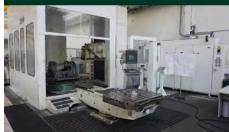
MILLING MACHINE MANDELLI MOD. REGENT 1500 H/U 2x1500

Automatic head Over Axis X mm -750 +2600 Axis U mm +750 +2600 Axis Y mm 2000 Axis Z mm 1500 ROTARY TABLE: Dimension mm 1100x1250