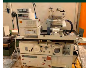
External grinder TACHELLA M-518 UA

Max grinding length mm 600 Max Diameter mm 255 Wheel size mm 457x76x127