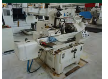
GEAR HOBBING MACHINE PFAUTER RS 9 KS

HORIZONTAL Max piece length mm 800 Max piece diameter 320 mm MODULE 10