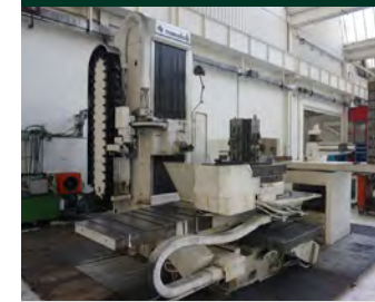
MACHINE CENTRE MANDELLI EGO 2200

CNC PLASMA CHANGE PALLET 900 X 900 ROTARY TABLE DIAM MM 1200 FIXED TABLE 700X1400 AXIS X 2200 MM. AXIS Y 2000 MM VERTICAL. AXIS Z 1100 MM ISO 50 ATC 40 POSITION