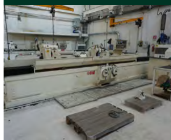
External grinder ZOCCA 3000 RU

Max Diameter mm 320 Max grinding length mm 3000 Wheel size mm 457x76x127