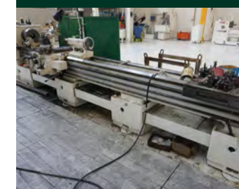
LATHE PBR 250x4000

Distance between centre mm 4000 Max turning diameter on the bed mm 530 Spindle bore mm 105