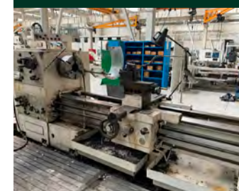
LATHE MERLI CLOVIS 430X2000

Length mm 2000 Height of centre mm 430 Bar capacity mm 105