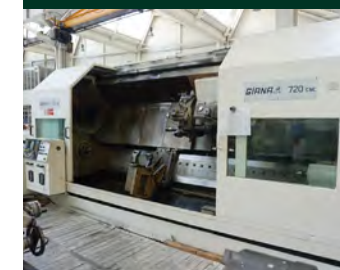
LATHE GIANA 720 CNC

LIVE TURRET AND C-AXIS CNC ECS 2302 Height centre mm 430 Distance between centres mm 4000 Spindle motor power HP 90 Chip conveyor - automatic spindle Autoblock diam. mm 500