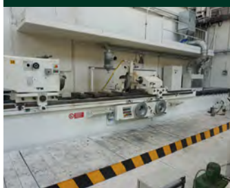
External grinder ACROS 5000

Height of center mm 375 Max grinding length mm 5000 Power mola HP 15 Wheel size mm 600x85