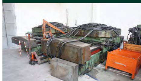
Automatic rotary tables CNC

N.2 automatic rotary tables TGTR: -dimensions mm 2000x2000 -axis V (traslazione) mm 1500 -load ton 15