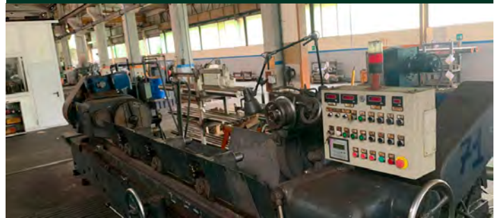
External grinder XC3 450x4000

Height of center MM 450 Max grinding length MM 4000