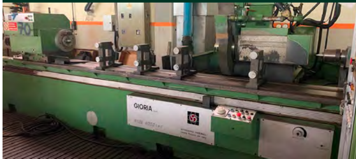
External grinder CNC GIORIA RU/S 4000

CNC Siemens sinumerik 820T Max grinding length mm 4000 Height of center mm 300 Wheel size 750x130x305 mm