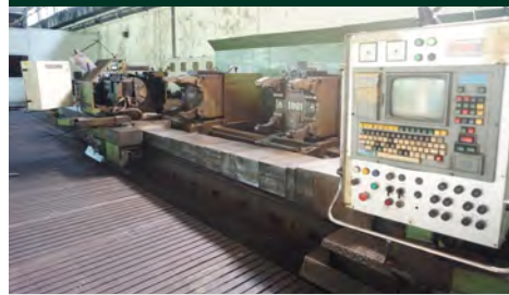
LATHE SAFOP LEONARD 50/S-CNC

DOUBLE CARRIAGE WITH INDEPENDENT CONTROL. FRONT SIDE SYSTEM FOR HORIZONTAL DRILLING. CNC ECS 2302 Height of centre mm 530. Distance between centre mm 10.050 DC motor power kW 80. 02 pairs Steady rest capacity mm 150:460