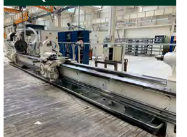
LATHE PASQUINO PNF 400x7000

Turning diameter on the bed 825 mm Turning diameter in the gap mm 1100 Distance between centres mm 7000