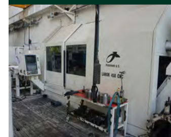
LATHE PADOVANI LABOR 450 CNC

Swing diameter on the bed mm 1050 Max turning length mm 2000: Spindle nose ASA 15 ° Spindle bore 206 mm Spindle motor (DC) kW 80 Upper turret 6 positions Lower turret 6 positions