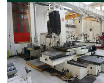
BORING MACHINE SAN ROCCO 10

Rotary table dimensions mm 1100x1300 Longitudinal stroke mm 1200 Cross travel mm 2000 Vertical stroke mm 1500 Boring spindle diameter mm 100 Boring spindle stroke mm 700