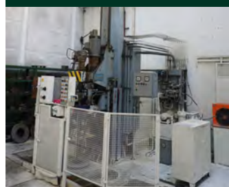
LAPPING NAGEL MM 3800

Max diameter mm 155 Min diameter mm 28 Max length mm 3800