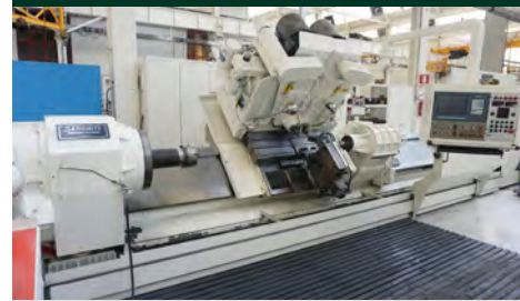
SCREW MILLING MACHINE SAPORITI

WITH DOUBLE HEAD (FOR HIGH PRODUCTION OF SCREW) 7 AXIS. CNC AUTOMATA Max workpiece length mm 4100 Max workpiece diameter mm 200