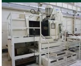
Surface grinder BLANCHARD 1500x100

Magnet diam mm 1500 Stroke table mm 1000 Sector stone mm 900 Vertical stroke mm 700